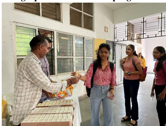
Arrival of participants