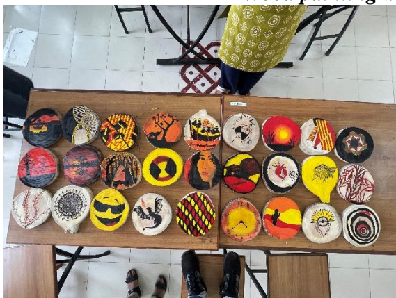
Clay moulding and wood painting workshop outputs