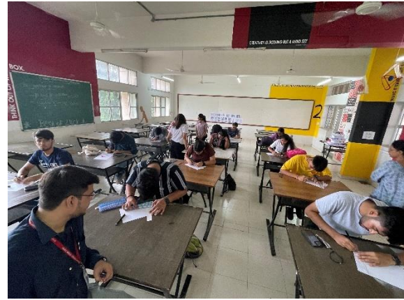
Bookmark Making workshop in progress