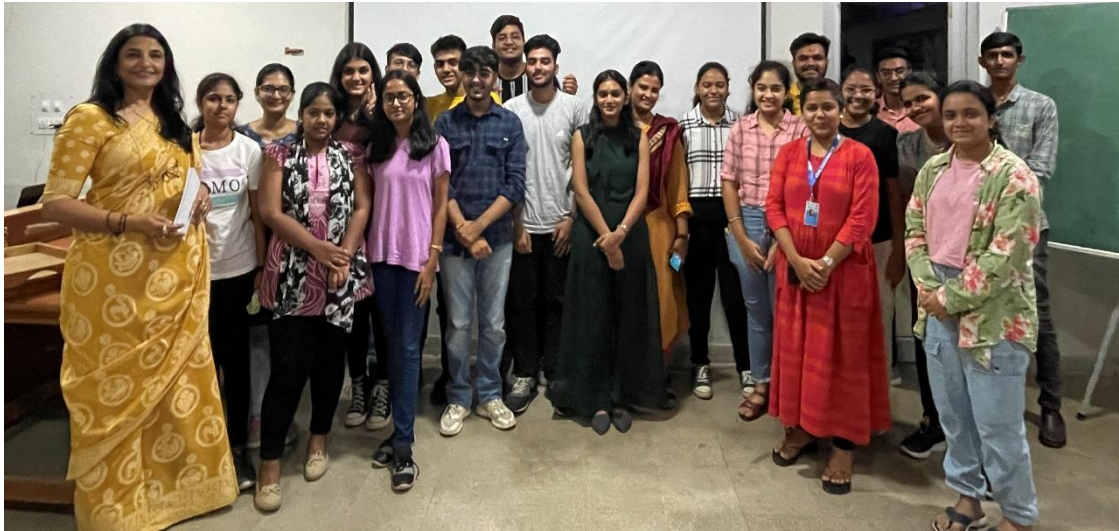
Participants in Bookmark Making workshop with Principal & Team SMAID