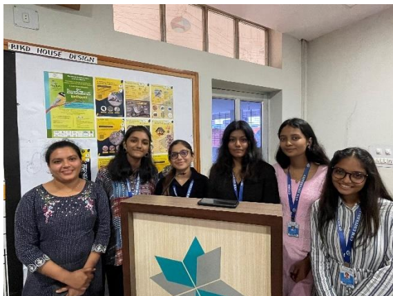
Volunteers during valedictory session