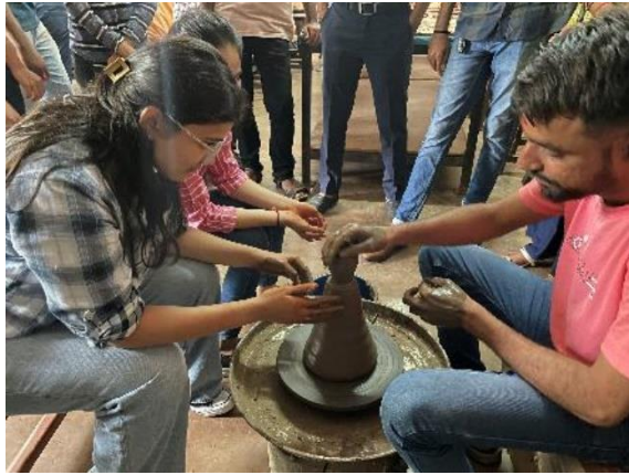
Clay workshop in progress