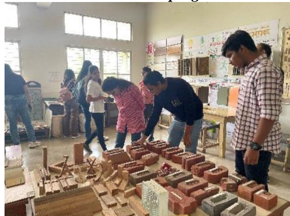
Visit to Material Museum