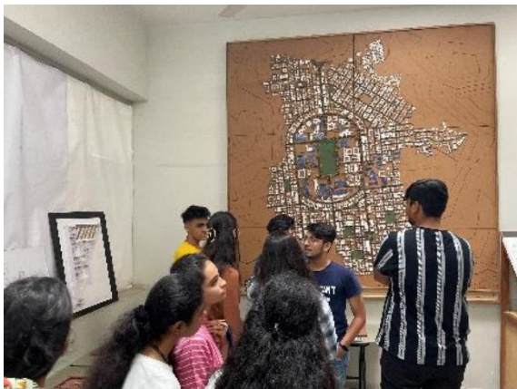
Visit at display in library reading room