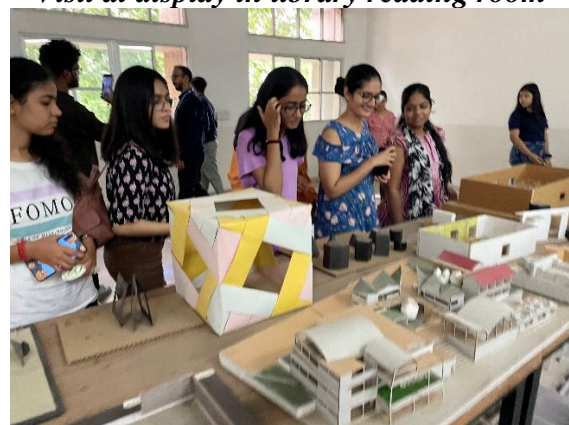
Visit to model display