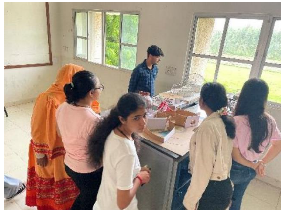
Visit to Classroom