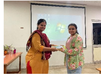
Prize Winners of Bookmark making workshop