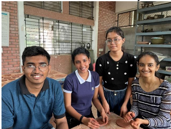
SMAID Volunteers during Clay workshop