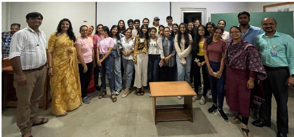
SMAID Team & participants of Clay workshop with Principal