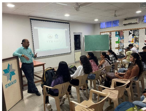
Welcome and introductory session