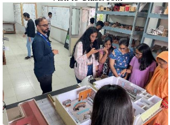
Visit to art room