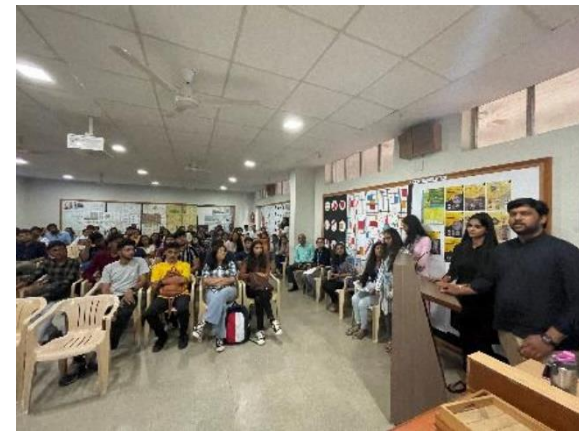
Talk by Alumni