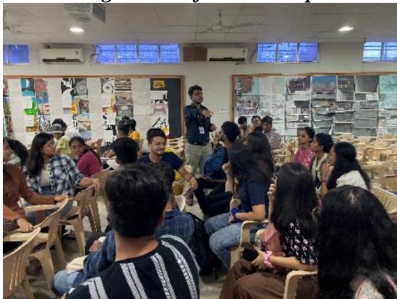
Instructions by participant coordinator