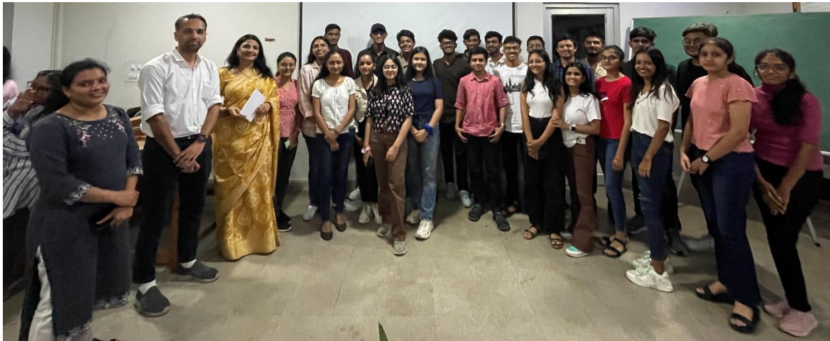
SMAID Team & participants of Wood Painting workshop with Principal