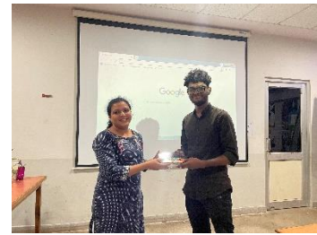
Prize Winners of Wood Painting workshop