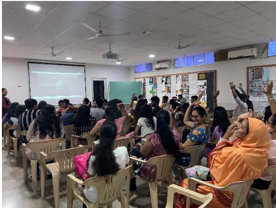
Registration for workshops