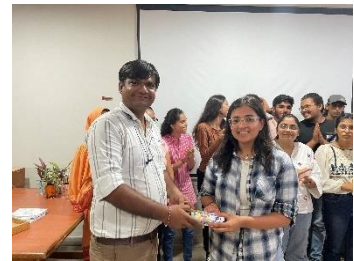
Prize Winners of Clay Moulding workshop