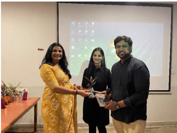
Felicitation of alumni