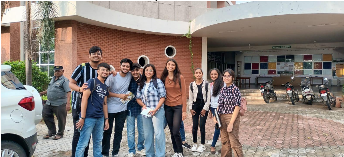
Participants Prior Departure