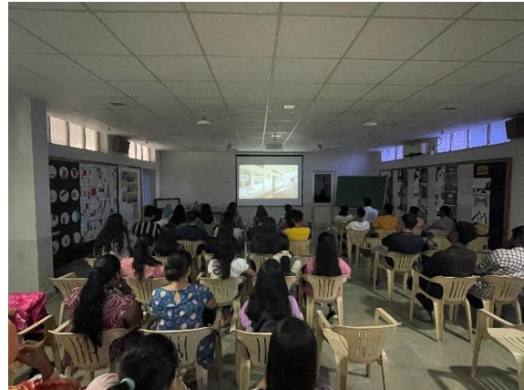
Video show in progress