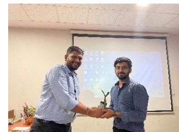
Felicitation of Participant coordinators