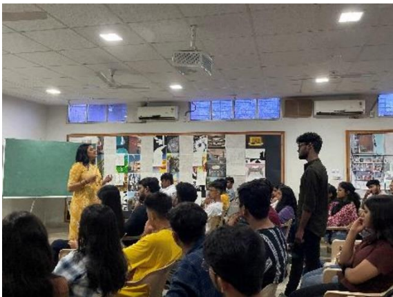
Interaction of Principal with participants